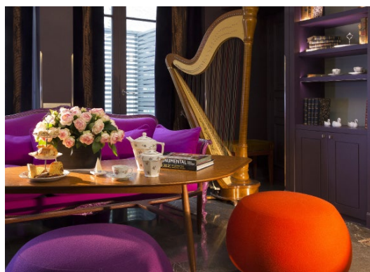
© "Salons de l'Hôtel & Spa La Belle Juliette"